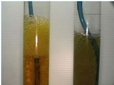
Competition XL7336 Foam @ 80° C

Oil filters are strongly recommended to ensure the integrity of XL7336 and extend fluid life in service.