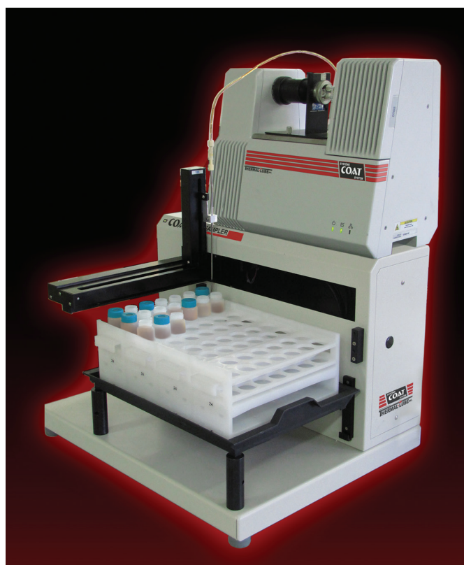
Figure 1. COAT system used for the FTIR determination of ASTM-identical AN and BN results for in-use mineral oils.

Fluid Life operates three laboratories, two in Canada (Edmonton, AB and Brantford ON) and one in Minneapolis MN and has provided lubricant analysis services and reliability solutions for asset intensive industries for over 30 years. In the field of commercial lubricant analysis and condition monitoring, FTIR spectroscopy is extensively used as an automated fingerprint-based survey technique; largely for screening and trending of qualitative changes in lubricant quality parameters such as moisture, glycol, soot, oxidation, antioxidants and wear additives. It is an automated means of screening a large number of oil samples, in part to determine if additional quantitative confirmatory analyses are required, typically ASTM AN or BN FTIR-based BN determinations (1). However, after extensive development and testing of this approach, it was concluded that chemometric PLS-based direct FTIR BN determinations were inadequate in terms of accuracy and reproducibility and incapable of dealing with the variability in, and the variety of mineral oils we processed. As a consequence, Fluid Life investigated a more rigorous approach developed by Thermal-Lube in conjunction with McGill University (2). Their turnkey FTIR COAT (Continuous Oil Analysis and Treatment) system is based on the use of stoichiometric reactions similar to those used by the ASTM titrimetric methods.